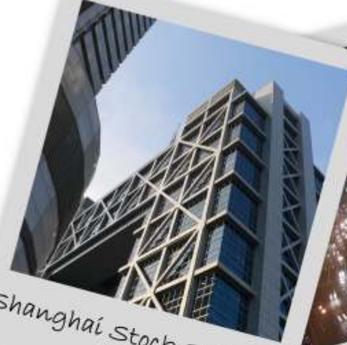
Shanghai Stock Exchange

Beside the modernization, the multi-cultural feature endows Shanghai with unique glamour. Here one can find the perfect blend of cultures, including the modern and the traditional as well as the western and the oriental. New skyscrapers and old Shikumen lanes together draw the skyline of Shanghai. Western customs and Chinese traditions jointly form the interesting Shanghai culture, which make your stay in the city truly memorable.